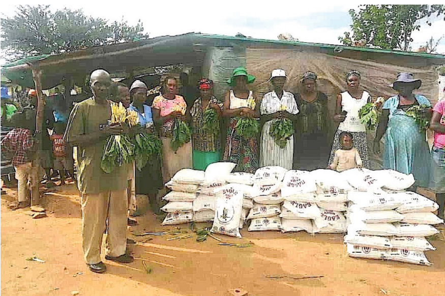
No Place to Call Home

If proof was required that there is still a need for the relief feeding it was provided, brutally, by a visit to Killarney. This is a community of some 120 families to the East of Bulawayo which has been within our feeding programme for many years. And it is a truly marginalised community of victims. Some of the residents have lived there a life-time yet, because they lack any proof of their legal title, they have frequently been raided and their homes destroyed by State security forces acting, it appears, on behalf of powerful interests seeking to clear the land for residential development. Moreover there are now ominous signs of another imminent land grab.