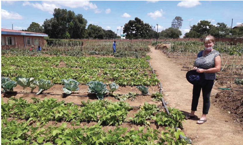
A Model Garden

think there is little to celebrate in Zimbabwe today. I suspect that not all the members of our team – and certainly not many of those whom they serve – enjoy the blessing of a regular breakfast, or any other regular meal. Nevertheless it was a celebration – registering a defiant hope against all that diminishes and destroys human flourishing within a beautiful land and among a beautiful people. Despite every obstacle, and against all the forces ranged against it, the Kingdom of God advances steadily.