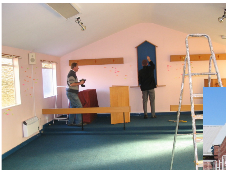
Dismantling the Old Chapel - 2006