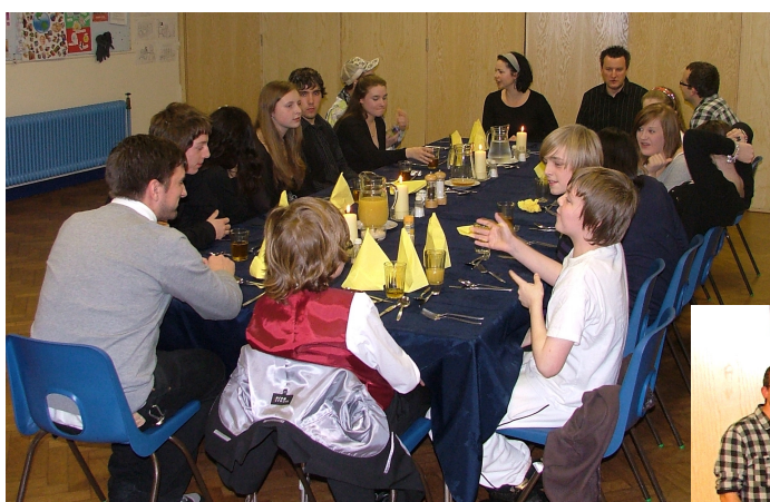
Youth Club Dinner ~ 2010