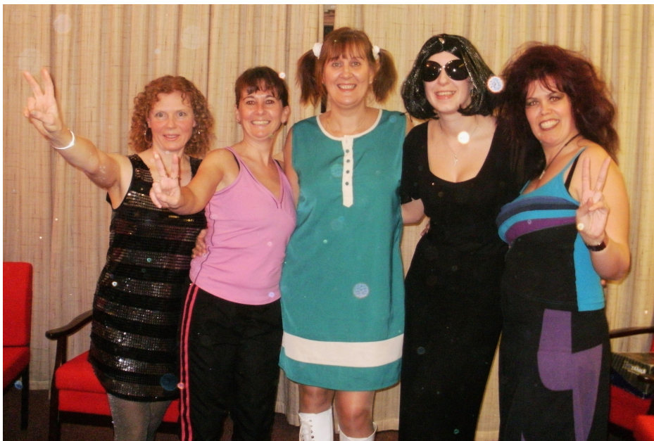
'Stars in Their Eyes' 2011