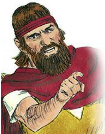
Elijah & Elisha

** Details in this newsletter or on the notice board in the hall.