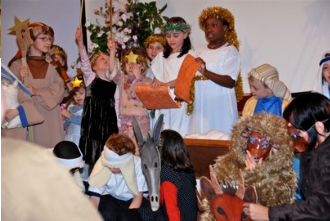
Wonford Carol Service 2006