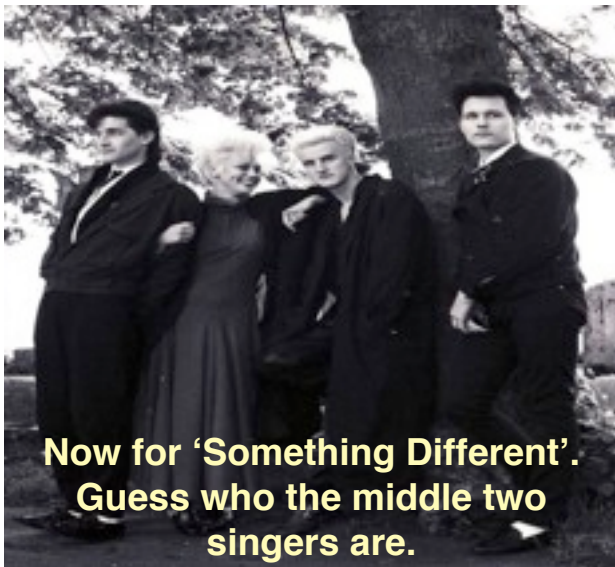
Now for 'Something Different'. Guess who the middle two singers are.

Many articles have been produced in this time and on the next few pages are some photographs from previous issues of the Wonford and Whipton Contact newsletters. Some photos maybe embarrassing - sorry!!