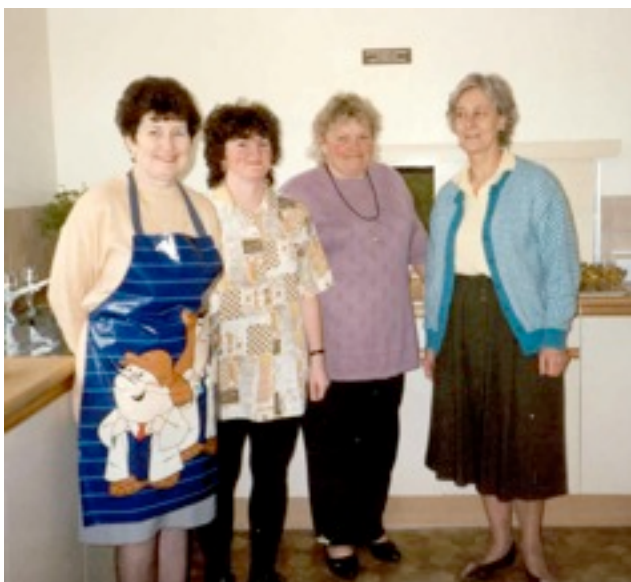
Who is the second from the left??