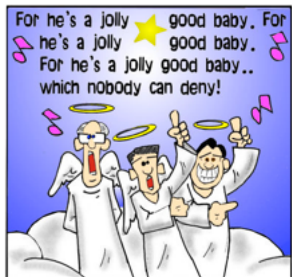
The Realms of Glory Choir tryouts for that first Christmas night included this spirited ditty. BUT as we all know, 'For he's jolly good baby' never be- c.